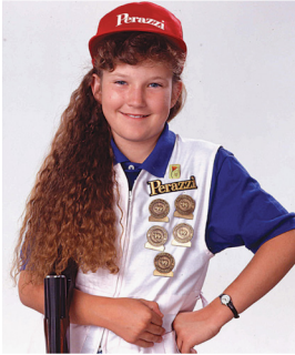
At the young age of 10, at the start of her career, and wearing her Olympic medals.